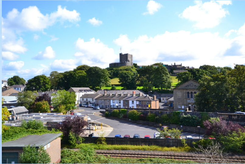
View of castle