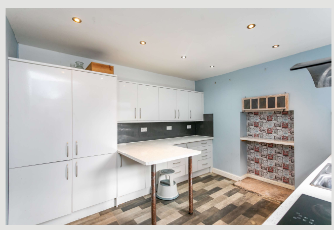
SELLING YOUR OWN HOUSE? We will be happy to provide free valuation and marketing advice, without obligation - please ask for details.

VIEWING: By appointment with our office.